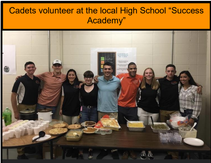
Cadets volunteer at the local High School "Success Academy"