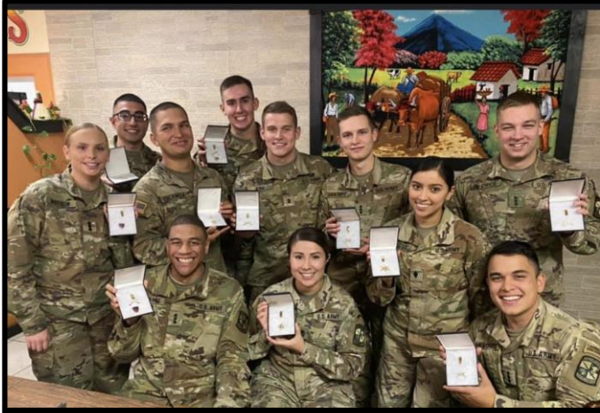
MS4s receive their branches.