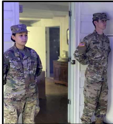
Cadets guarding the SHSU class rings through the night.