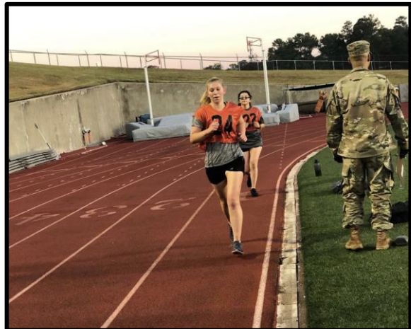
Bearkat Battalion performing its record APFT.