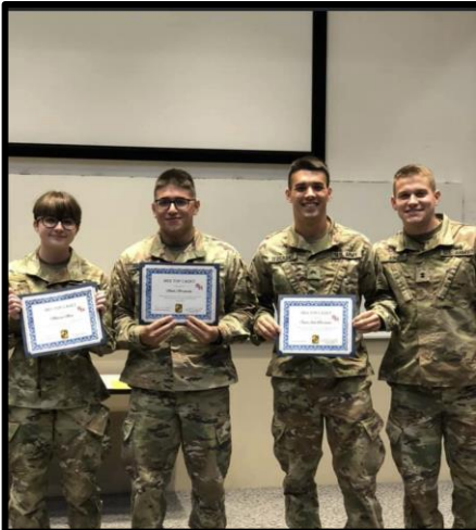
Academic awards given during our award ceremony.