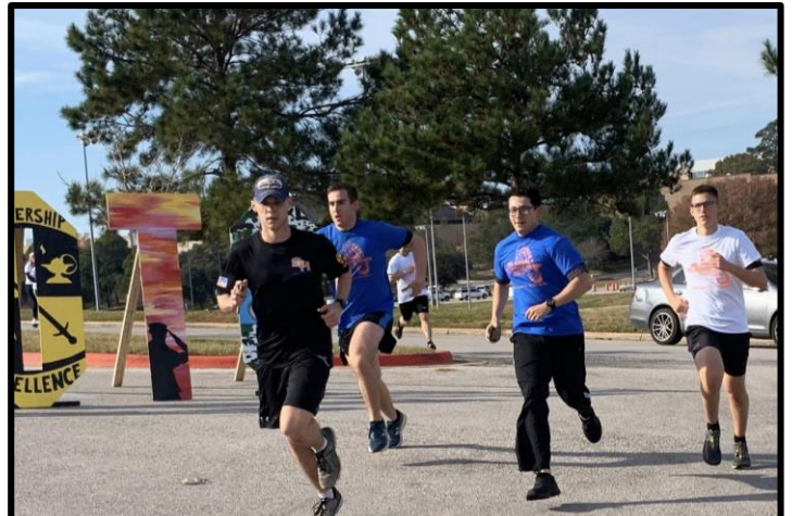
Racers cross the finish line completing the 5k.