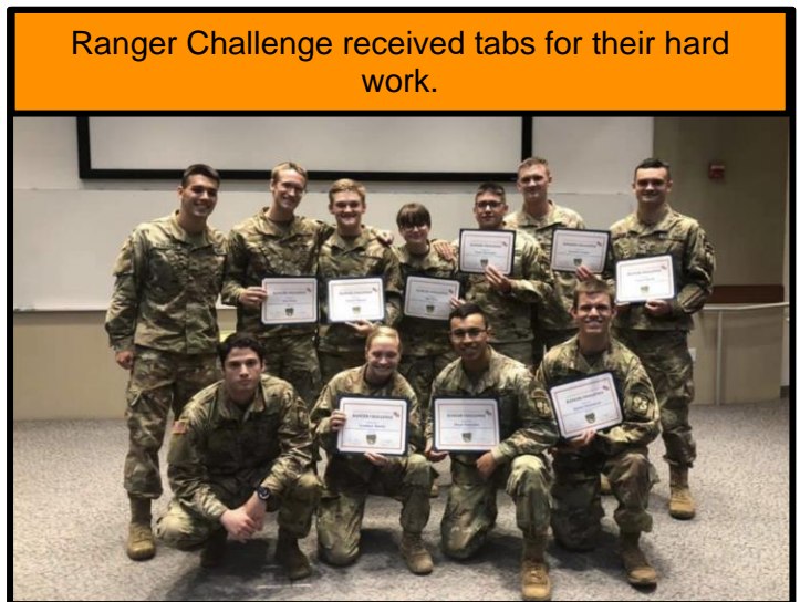
Ranger Challenge received tabs for their hard work.