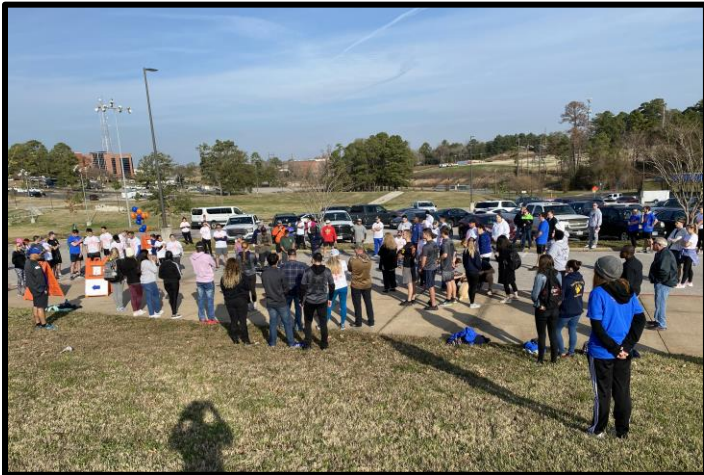
The crowd getting fired up to start the race.