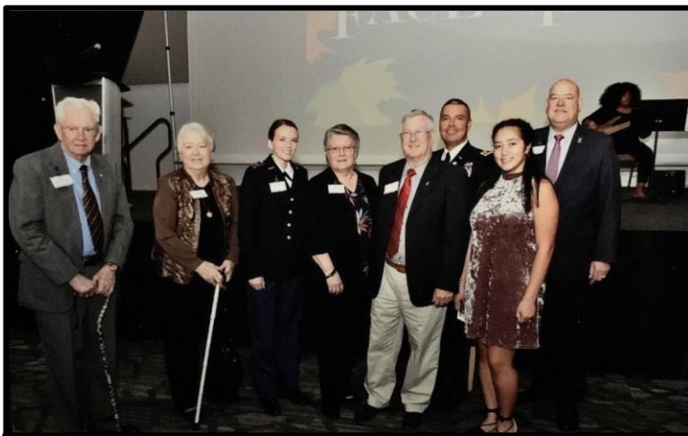
The "Face-to-Face" Scholarship Lunch