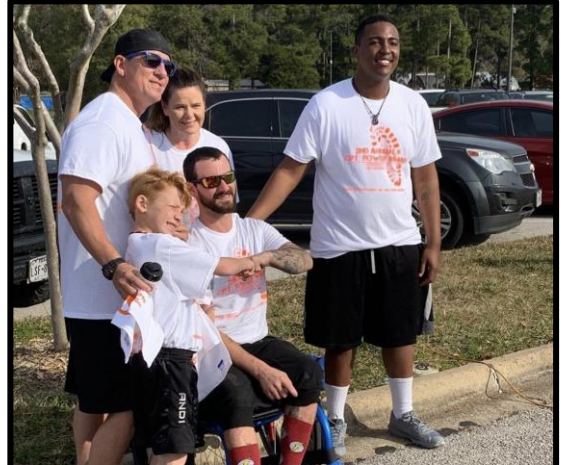
Participants of the Rowdy Inman 5k.