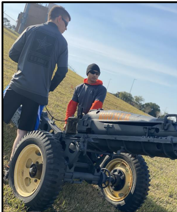
Cadets fire the cannon to signal the start of the race.