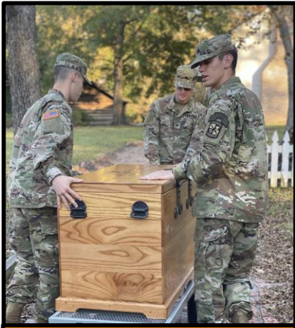
Cadets moving the SHSU class rings.